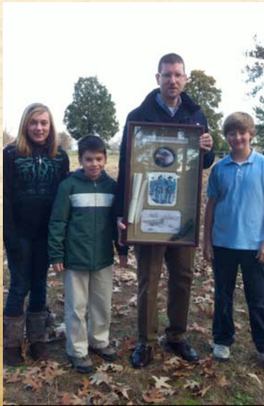
Team Veritas, Freedom Challenge 2011