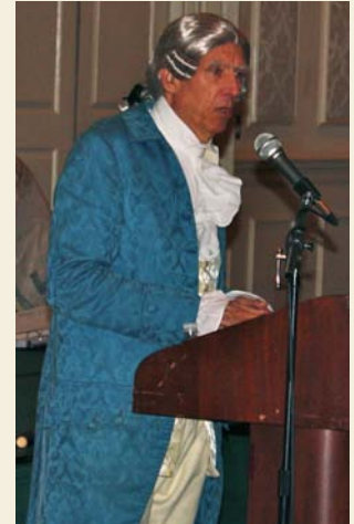
Colonial Dance & Feast, 2011